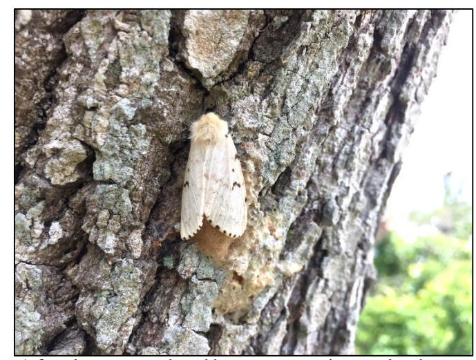
A female gypsy moth and her egg mass, picture taken by Chris Elder (NCDA&CS – Plant Industry) in Buxton, NC.

Determining Treatments. In addition to this year's trap counts, trap counts over the past several years and results from winter egg and pupal case surveys help to determine what treatment is most