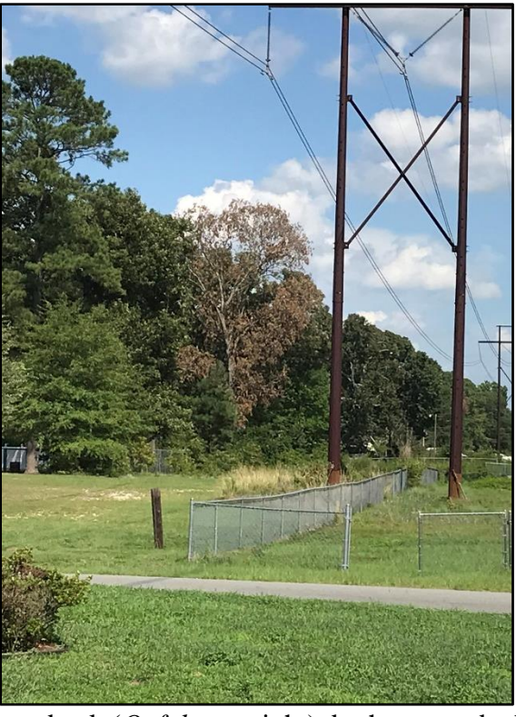
Sand post oak ( Q. margaretta ; left) and Southern red oak ( Q. falcata ; right), both succumbed water stress caused by excessive rainfall followed by a "flash drought".