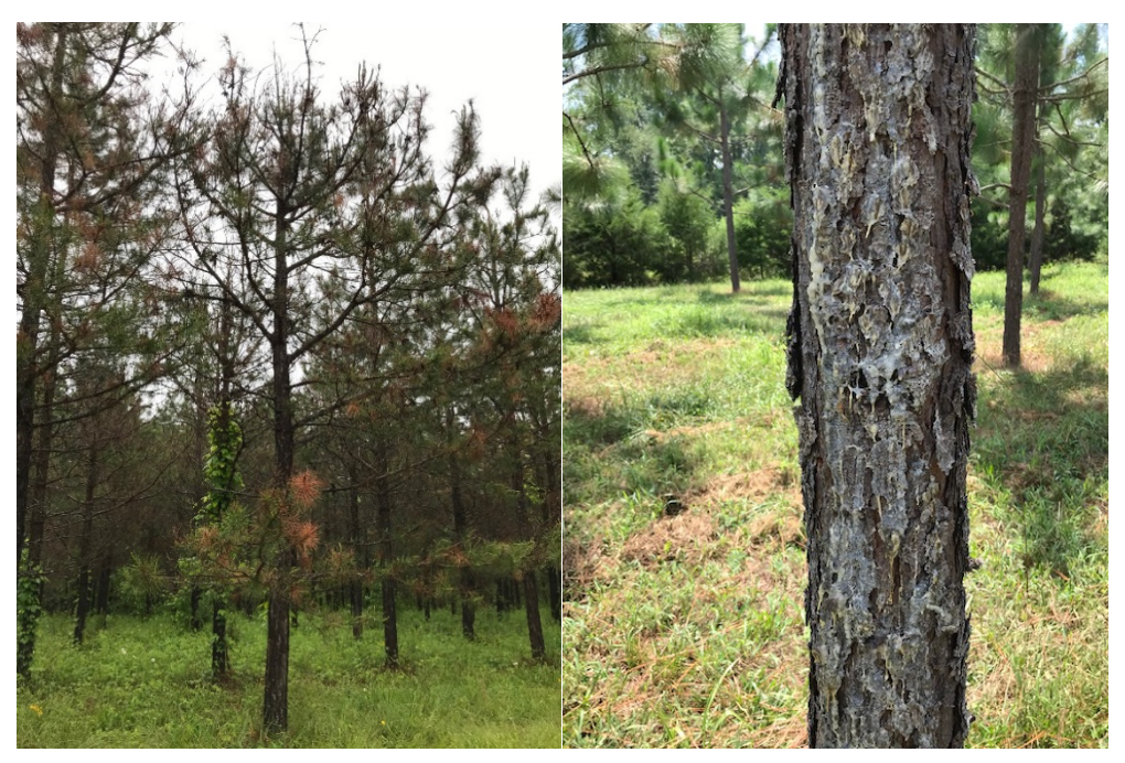
Left: Pitch canker foliar symptoms (discoloration and branch dieback). Right: Pitch Canker stem symptoms (oozing pitch).

Pitch canker is a disease that has typically had a minor impact among native pines in North Carolina. This year there was a noticeable increase in activity with this disease, likely due to ideal moisture levels caused by higher than normal rainfall over the past several years. Pitch canker was documented in short leaf, loblolly and white pine stands, with scattered pitch canker mortality found throughout the state. Mortality was usually limited to exposed outer edges of pine stands, as well as in open grown pines located in fields and rights of way. Tree mortality was most prevalent in edge trees with access to nitrogen from adjacent fields. High nitrogen levels have a direct relationship to pitch canker infection rates. Another factor was significant exposure to wind and hail that caused branch wounds—access points for disease infection. Although highly visible, overall mortality was only present in very small percentages of most of the infected forested stands.