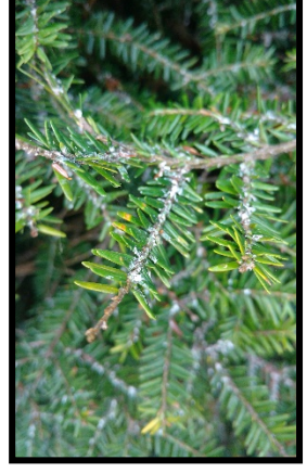
Cell phone pictures can be used for diagnosis of insect, disease and other forest health issues.

The devastating <u>laurel wilt</u> disease was first confirmed in North Carolina in 2011. This year, it was detected in Wayne County, bringing the total to 12 positive counties in the southeastern part of the state. Laurel wilt was previously detected in Bladen, Brunswick, Columbus,