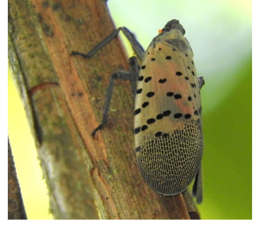
Spotted lanternfly

Two pests of concern not yet found in North Carolina have been detected in adjacent states. Spotted lanternfly has been found in northeastern states for the past several years and, two years ago, was reported for the first time in Virginia. While mostly a pest of fruit trees and grapes, it is known to attack a variety of hardwood trees found in North Carolina forests. Likewise, Asian longhorned beetles have been