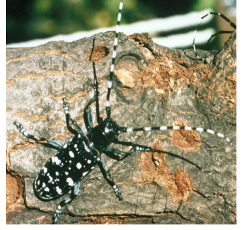
Asian longhorned beetle

Two pests of concern not yet found in North Carolina have been detected in adjacent states. Spotted lanternfly has been found in northeastern states for the past several years and, two years ago, was reported for the first time in Virginia. While mostly a pest of fruit trees and grapes, it is known to attack a variety of hardwood trees found in North Carolina forests. Likewise, Asian longhorned beetles have been