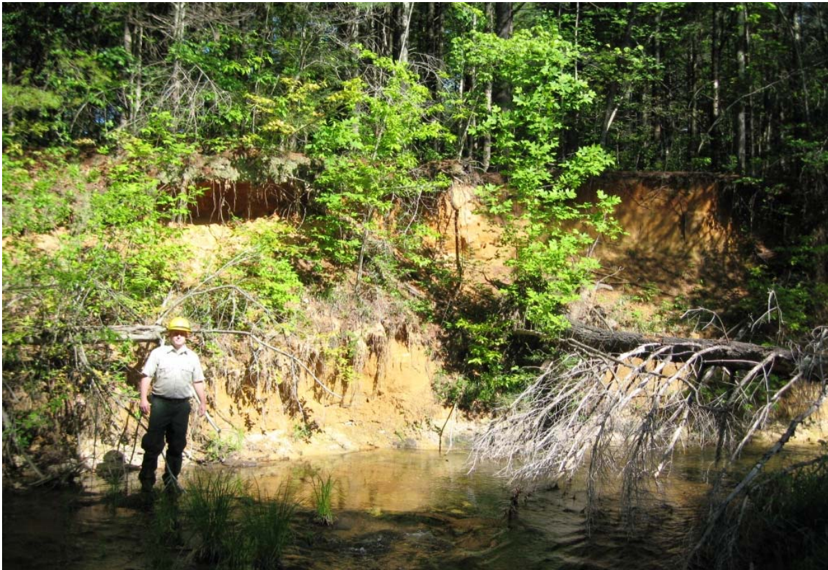
Two photos of the stream's eroding and collapsing right-bank escarpment: Above taken May 2009. Below taken Sept.2009. Note the safety vest hung on a limb to show relative height of the escarpment (circled).