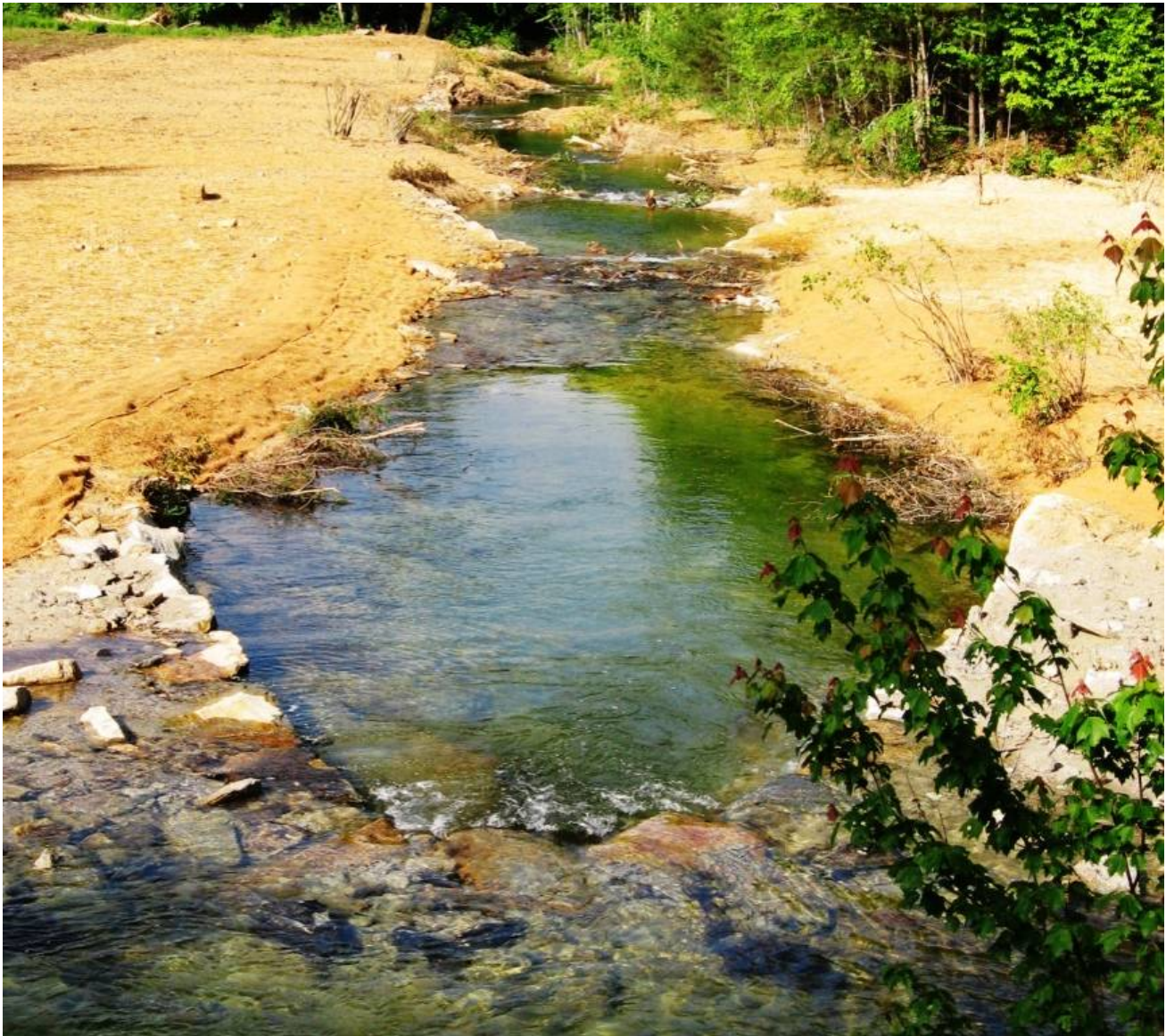
Photo above showing completed restoration work, view from the Conservation Road bridge. Soil surface on either side of the new stream channel has been covered with seed and straw.