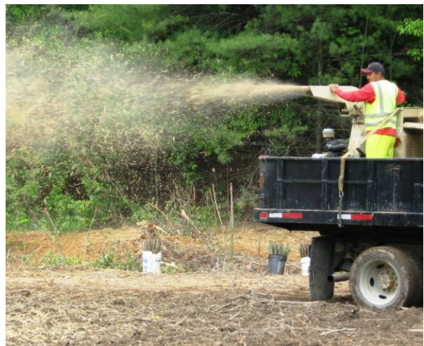
Photos above show steps taken for streambank and groundcover stabilization. Top-Left: Live stakes to be installed, and coir matting already installed. Top-Right: Straw is blown across the area after grass seed has been applied.