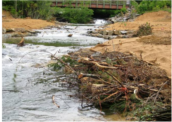
Photos above show close-up of woody material that was incorporated into the design. Top-Left: A log X-vane was installed within one of the pools, below a rock/boulder vane structure. Top-Right: Bundles of small woody material were partially buried in sections of the new streambank.