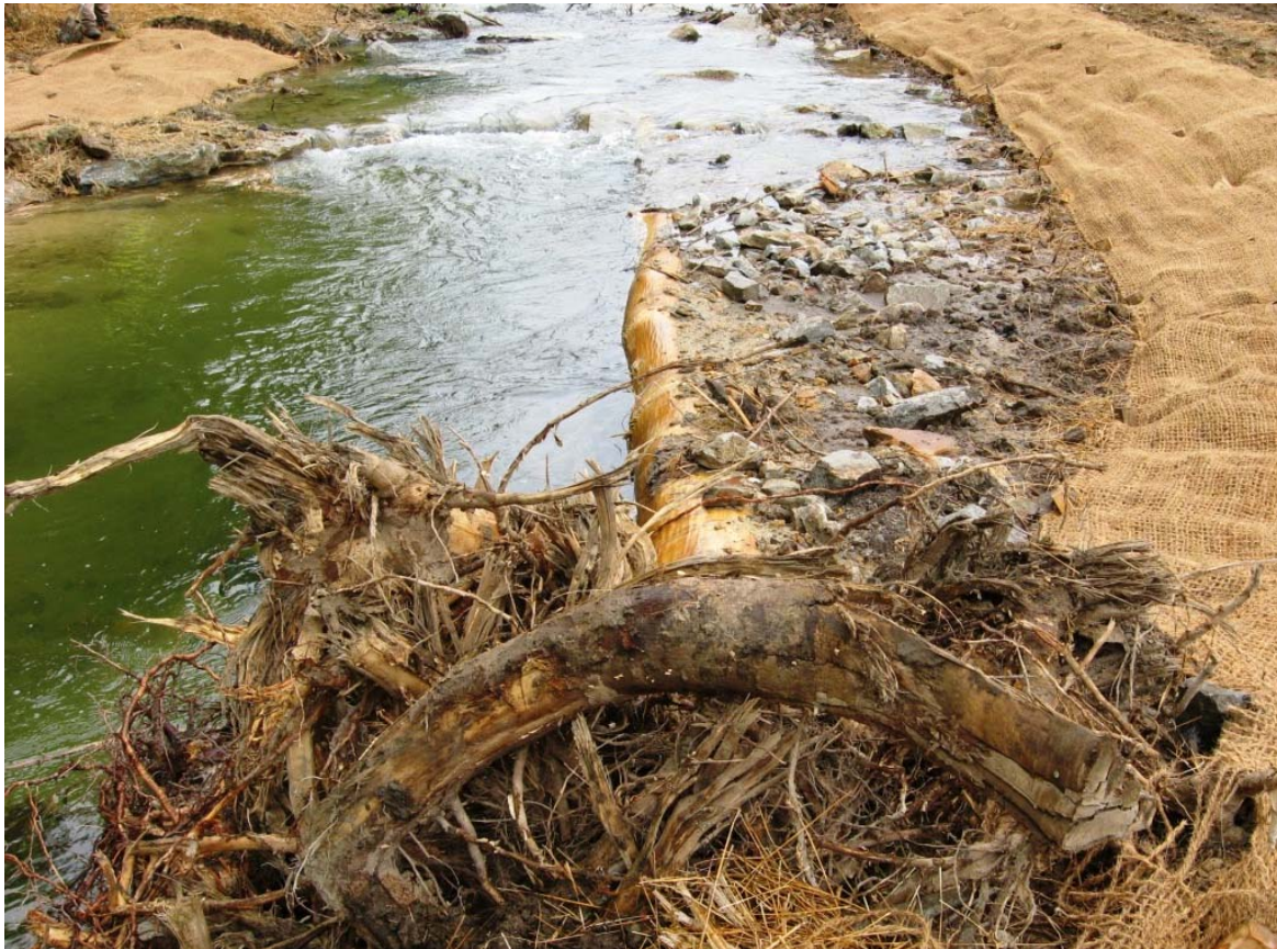
Photo above shows a log vane with attached rootwad installed along new left-bank.