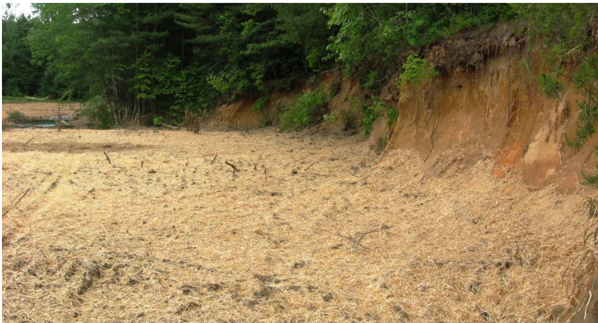
Photo above shows the former right-bank escarpment back-filled and ground surface stabilized. The upper portion of the escarpment was left intact to sustain active nesting cavities for swallows. With the stream no longer undermining this embankment, we do not expect any significant soil loss or slumping.

All of the boulders and backfill material for the project were obtained from various locations on DuPont State Forest with coordination and agreement of the Forest Supervisor. The use of existing state-owned materials allowed this project to be financially viable.