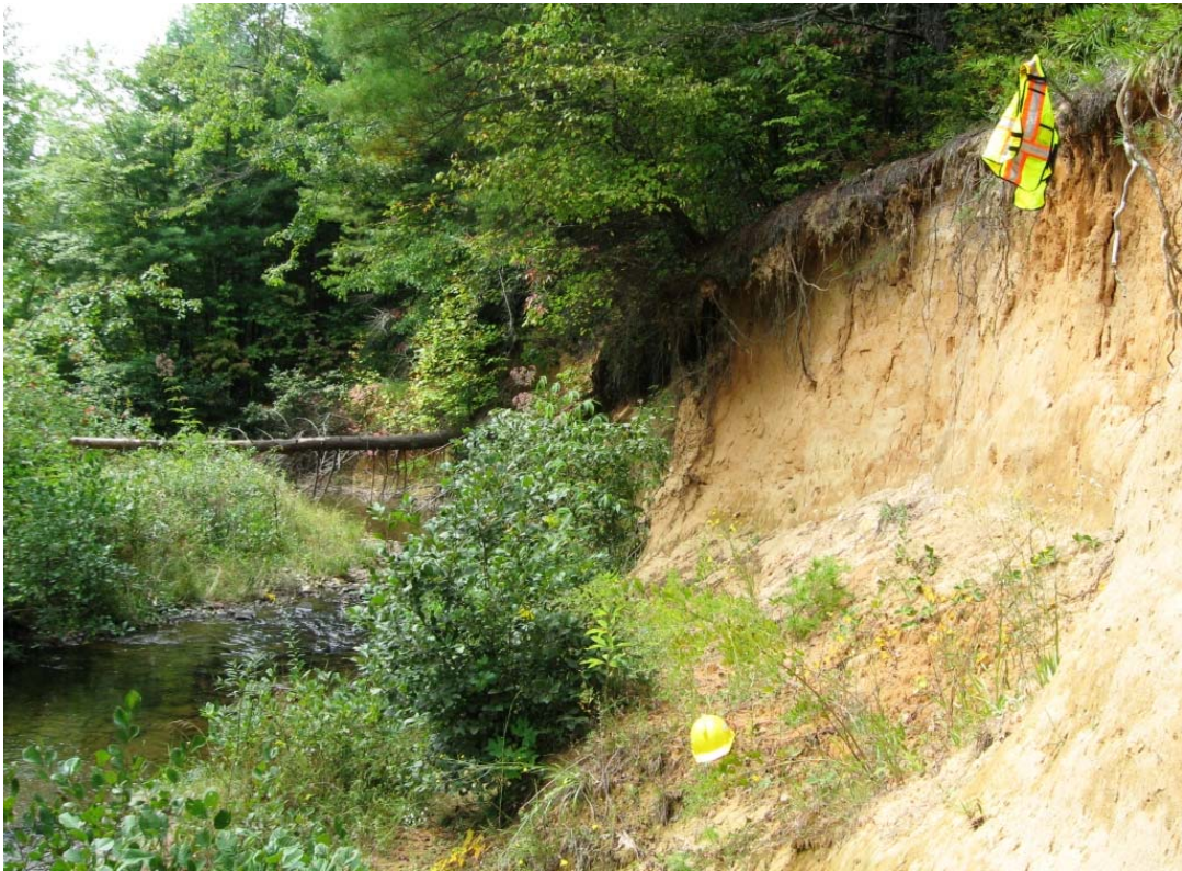
Photo above taken Sept.2009 showing close-up of escarpment. Photo below from Dec.2010, taken from the bridge on Conservation Road. The escarpment can be seen through the trees in the background (arrow).