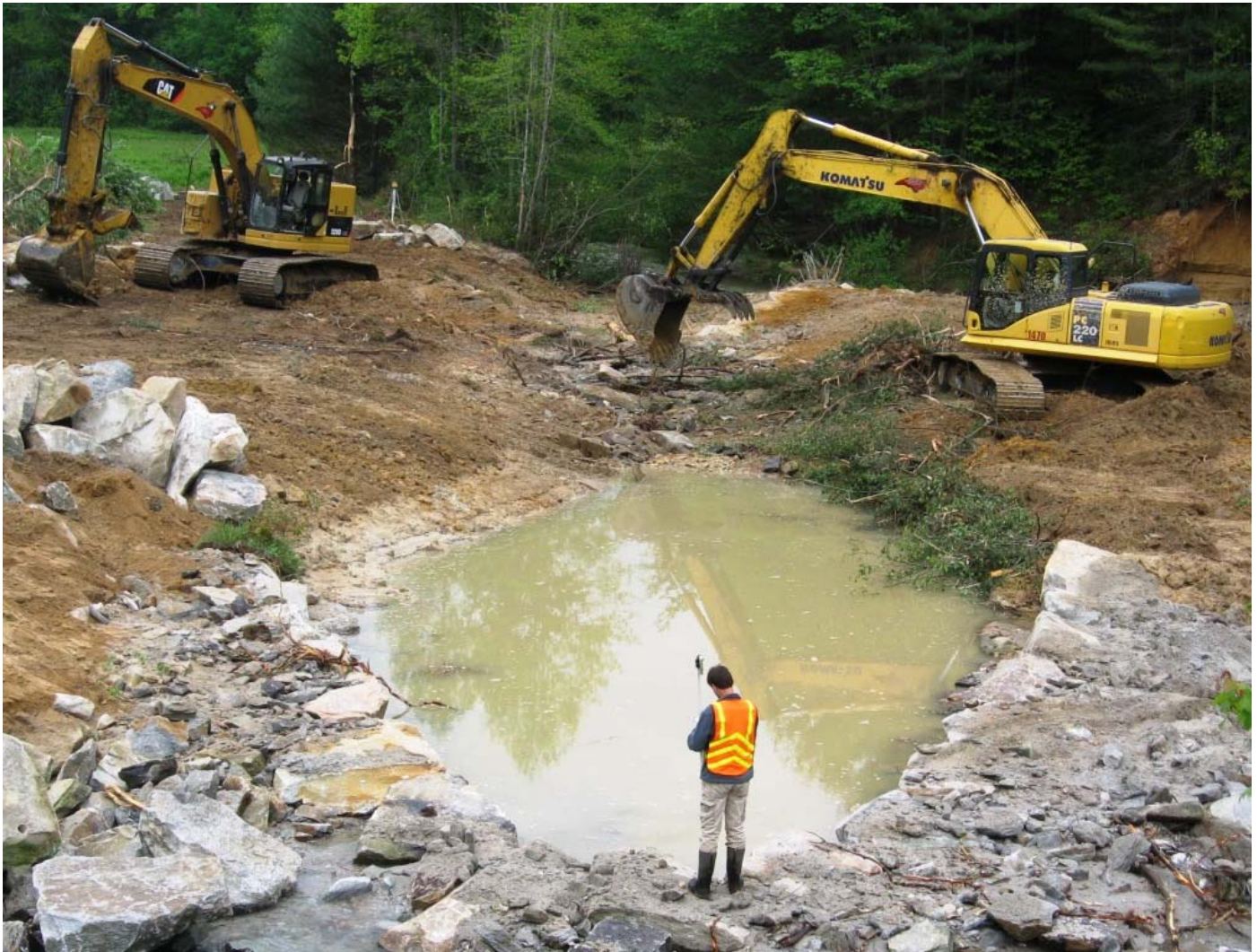
Photo above taken from the Conservation Road bridge during construction. Seen in the photo is the first large boulder vane immediately downstream from the bridge. Also note the bundles of small vegetation installed along the right bank to incorporate organic matter. The excavator on right is establishing a riffle segment.

Five boulder cross-vanes were installed in the new channel, each with a corresponding pool that allows the water to calm and sediments to settle out. Two riffles were established with large cobble taken from the old channel. Special attention was made to incorporate woody debris and organic matter in the design of the new stream channel.