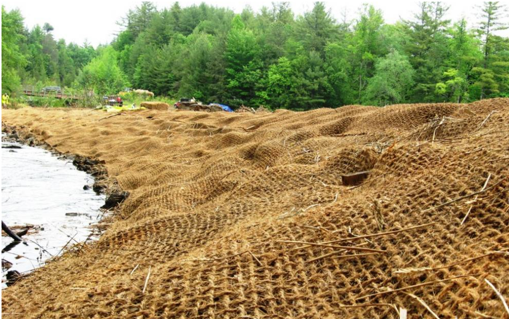
Photo above shows the new slope gradient along the left-bank, to improve the hydrologic connectivity to the floodplain.

A new floodplain bench was excavated along the length of the new left-bank to improve hydrologic connectivity between the new stream and the legacy floodplain. A similar bench, and a boulder sill, was established along the section of new right-bank upon backfilling of the old stream channel, against the base of the embankment escarpment.