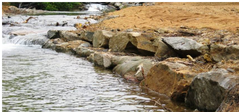
Photo above shows close-up of one rock/boulder vane arm on the new left-bank.