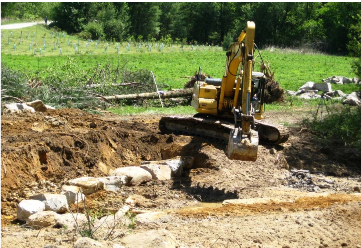
Photo above showing construction of one of the rock vanes. The new channel is situated in the legacy floodplain area.

A new stream channel was excavated to the south of the old channel for an estimated length of 500 to 600 feet. The new channel is situated in a flat legacy floodplain area. Some design considerations had to be adapted to accommodate the site conditions. Upon initial excavation, it was determined that little to no rock or cobble existed within the soil profile of the new stream channel's location. The soil was nearly completely fine alluvial sediments and, in fact, the sediments were perched upon a thick layer of heavy clay that was found at a depth of about four feet. Having no suitable rock or cobble to work with, this type of material was salvaged from the old channel as needed during construction. In addition, the alluvial sediments necessitated the reduction of the new stream channel's sinuosity; with the fine sediments and expected heavy water flows, a meandering design would have been very challenging to maintain for structural integrity.