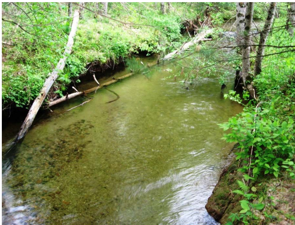
Both photos taken May 2011. Above shows a typical pattern of the stream: somewhat incised banks, silted substrate, and lack of pools. Below shows left-bank of the stream. Sediment deposition did occur at places along both sides of this stream, but the stream was still largely disconnected from its floodplain.

In addition to the concerns of the unstable embankment, the outfall stream had limited functionality to support aquatic organisms and fish due to a lack of in-channel woody debris, deep pools, or cobble substrate. The outfall was functioning much like a ditch, with a heavily silted substrate, incised channel banks, and was disconnected from its floodplain area.