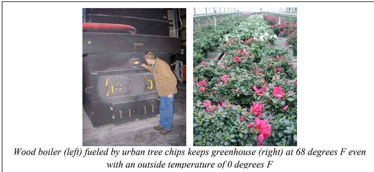
Wood boiler (left) fueled by urban tree chips keeps greenhouse (right) at 68 degrees F even with an outside temperature of 0 degrees F

finishes, and more. One of the flooring options retailed at Natural Built Home is elm flooring manufactured by Wood from the Hood (see above) from Minneapolis trees infected with Dutch elm disease. Natural Built Home advertises this flooring as its most eco-friendly option because it is both locally salvaged and locally milled.