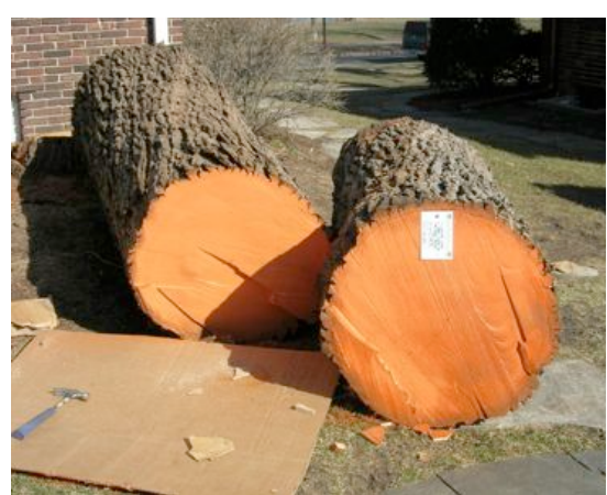
White oak logs processed by Wood from the Hood into value-added products