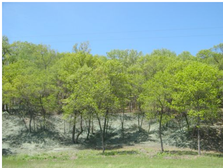
The Indian Mounds Regional Park in St. Paul generated 372 tons of biomass as a byproduct of an oak forest, oak savanna and remnant prairie restoration project

A direct example of how government actions can support a key player in a business cluster occurred in 2007 when the Minnesota Legislature appropriated $500,000 to the Department of Natural Resources, Division of Ecological Resources, to implement a new and innovative project titled “Linking Habitat Restoration to Bioenergy”. The funding was to help assist habitat restoration efforts that might not have otherwise occurred while making the woody material generated as a by-product available to District Energy St. Paul and other bioenergy facilities. By law, all restoration projects funded through this mechanism had to be within 75 miles of St. Paul 31 (see Case Study #1).