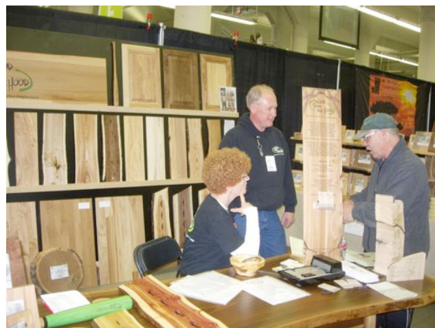
2010 Live Green Expo in St. Paul included over 18,000 attendees and 200+ exhibitors including urban wood reclaimers

According to a recent survey, the Twin Cities of Minneapolis and St. Paul rank as the 11 th greenest metropolitan area in the nation (out of 41 areas). 37 Minneapolis is home to over 160 green businesses according to the city’s Community Planning & Economic Development Department and the city has a commitment to help green businesses succeed as a part