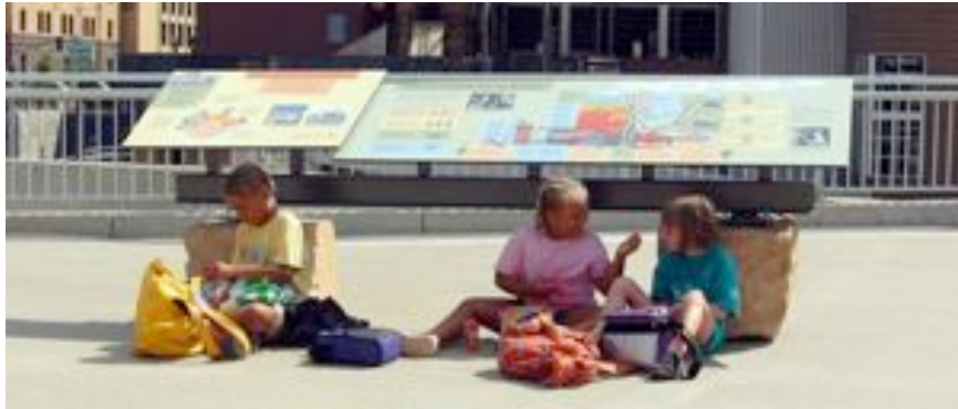
District Energy St. Paul developed an innovative biomass educational project, including several outdoor interpretive panels, with its next-door neighbor, the Science Museum of Minnesota

different “raw material model” was needed to lessen challenges. Consequently, a closely affiliated partner—Environmental Wood Supply (EWS)—was created to procure all wood used by the CHP plant. EWS also was responsible for developing agreements with communities, private arborists, loggers, and other entities that were