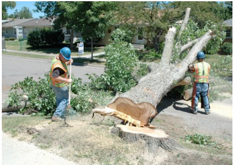
The Minneapolis Park and Recreation Board, Forestry Division, has created an innovative lease arrangement (cost avoidance strategy) with a private firm for trees larger than 18 inches in diameter

#2 – As noted above, the MPRB has a fleet of chippers. These machines are capable of handling logs up to 16-18 inches in diameter. Chips generated by these machines either go to neighborhood chip sites (see below) or are transported to two staging areas where they are