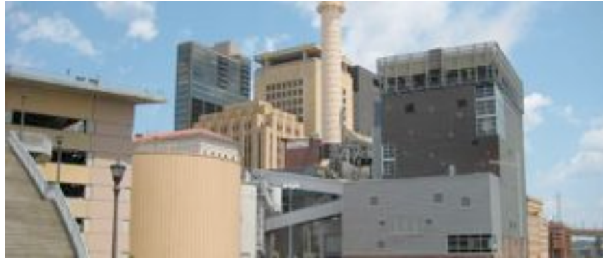
District Energy St. Paul operates the largest biomass-fueled hot water district heating system in North America

Discussion of urban wood utilization in the Twin Cities invariably leads to a discussion of District Energy St. Paul due to its size and impact on regional wood supplies and markets ( http://www.districtenergy.com/ ). District Energy operates a combined heat and power (CHP) plant that uses up to 1,000 tons of wood chips per day, predominantly sourced from municipal areas. 13 District Energy produces hot water, steam or chilled water at a central point and distributes the energy through underground pipes to buildings. Currently, heating service is provided to 31.1 million sq. ft. of building space, or 80% of St. Paul’s central business district and adjacent areas. Cooling (air-conditioning) is provided to more than 18.8 million sq. ft. of downtown building space.