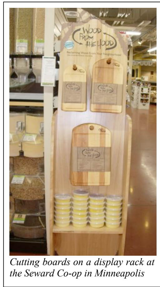
Cutting boards on a display rack at the Seward Co-op in Minneapolis

At the nearby Seward Food Co-op, Cindy noticed that all the cutting boards for sale were made in China. Recognizing an opportunity, WFTH produced 8 or 9 different styles of cutting boards (samples), and Cindy shared them with Co-op management. The staff at the Co-op were impressed with the cutting boards and were eager to add a locally made product to their store offerings. Currently, WFTH sugar maple cutting boards (in 3 sizes with a “belly band” describing the