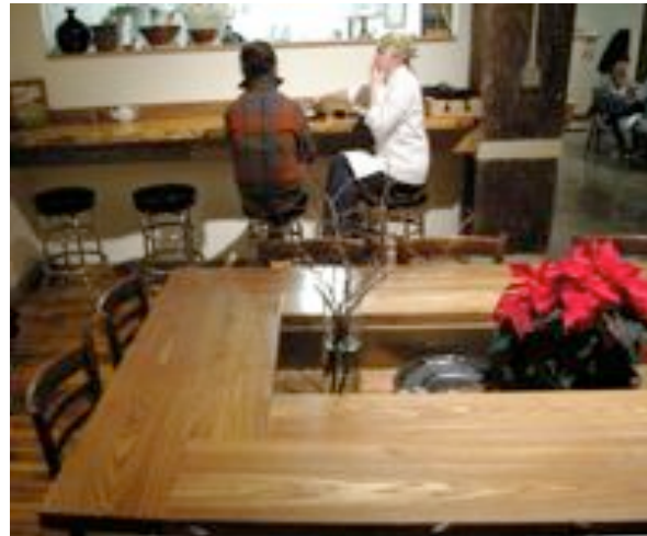
Red elm table made by Scheftel Construction from an urban tree for a St. Paul restaurant

Scheftel has used a variety of urban tree species in his projects including black walnut, red elm, honey locust, cherry and spalted maple. For more information on Scheftel Construction, see http://www.scheftel.com/ .