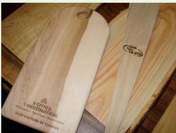
Wood from the Hood cutting board (left)

“Hands down, the most surprising thing has been how well the cutting boards have been received by the public. They have been flying off the shelves almost faster than we can produce them. In August [2009], we introduced our newest product, ‘Mineral Bee,’ a cutting board conditioner that also has been flying off the shelves. It really seems that people are very hungry for locally produced products.”