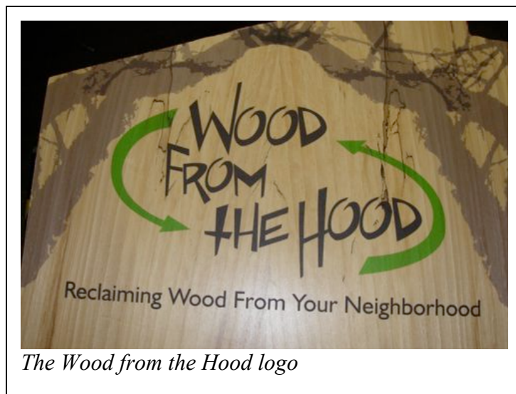
The Wood from the Hood logo

Today, Wood from the Hood produces a variety of hardwood products including flooring, millwork, furniture, picture frames, cutting boards, cribbage boards, coaster sets and more. All of the lumber and value-added products can be tracked to the zip code (neighborHOOD) where the tree was harvested. In some cases it can be tracked to the specific address. This gives the wood product a connection to the community.