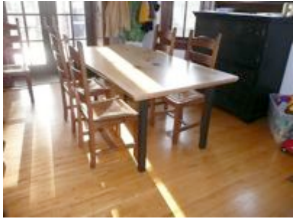
Reclaimed elm table by WFTH

WFTH continues to network with tree service firms to get more of them to offer a “product option” to homeowners removing trees from their property.