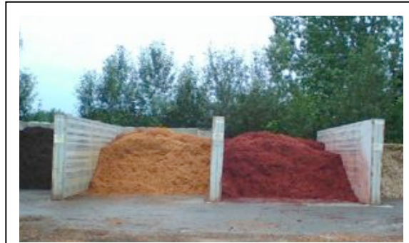
Landscape mulch from urban trees-- shown here in various colors and textures--is a popular product in the Twin Cities.

Metro Wood Recycling operates three sites in the Twin Cities (two in Minneapolis and one in St. Paul) and all are designated as ash tree waste disposal sites. Commercial (e.g., tree service firms) and residential wood disposal is permitted at all three sites. No tipping fee is charged for logs four feet or longer in length; a tipping fee of $5/yard is assessed for brush (converted to biomass). Mulch is Metro Wood's primary product (90%) with the remainder going to biomass (District Energy). Metro Wood operates coloring and bagging machines for its mulch products with the bagged product sold to big box stores; bulk product goes to landscape supply stores and dealers. "Fines" from the mulch process go into a potting soil medium. Metro Wood has learned they can "extend the life of the log" by first producing a mulch product and then 2-3 years later converting the deteriorating mulch into biomass. Metro Wood Recycling has periodically provided a very small quantity of saw logs to urban tree reclaimers.