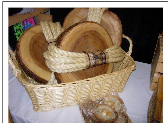
Tree swings are one of many natural wood toys made from urban trees by The Original Tree Swing Company

The Original Tree Swing is a Minneapolis-based family owned and operated business started nine years ago as a part-time venture. In September 2009 owner Bill Pine took the venture full-time as a producer of open-ended children’s toys made from natural materials—primarily reclaimed wood. The Original Tree Swing products include nearly two-dozen different toys such as tree swings, castle blocks, bowl/spoon/board play sets, old-time tops, tree puzzles, growth sticks, and more. Ninety-five percent of the lumber used by Pine for his business is from reclaimed urban trees sourced from Wood from the Hood (see above as well as Case Study #3). The Original Tree Swing products are currently carried by more than 50 retail shops across the U.S. plus three foreign countries. For more information on The Original Tree Swing, see http://www.theoriginaltreeswing.com/ .