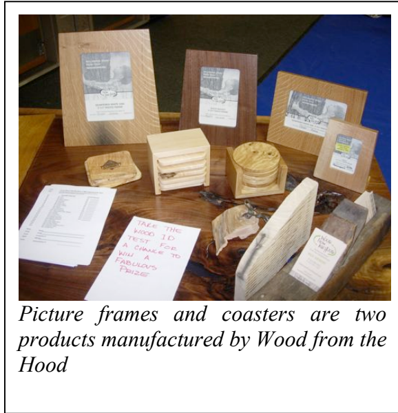
Picture frames and coasters are two products manufactured by Wood from the Hood