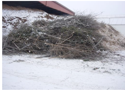
Tree trimmings that will be processed into biomass fuel