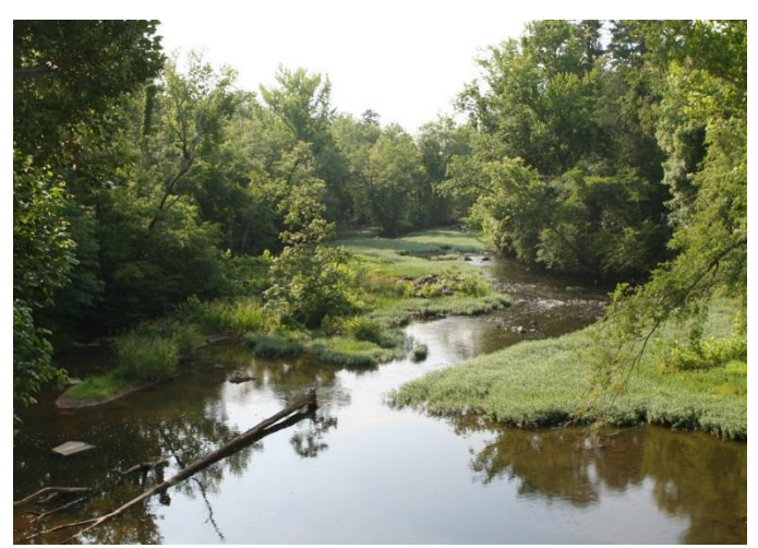
Haw River at Bynum.

A watershed is the area of land that water travels across on its way to a stream, river or lake. What happens uphill, or upstream, in a watershed has an effect on everyone downstream. As North Carolina's population continues to increase, it becomes more important that communities create a watershed plan that identifies how clean the water is, how the land is used and where water pollution is coming from. This type of plan identifies places in the watershed where forests, parks and other open places are needed and where they can be restored, and protected. Most watershed plans include a combination of protection and restoration measures. Protecting natural resources is more cost-effective than restoration but, unfortunately, such efforts often occur after significant impacts have already Workina lands undeveloped occurred. and greenspaces allow people to work the land, explore the forests, play in the parks and exercise outside while the water is cleaned and replenished.