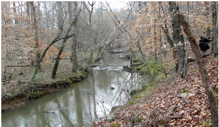
Trees along streams filter runoff and keep water cool for fish.

Does your town or city have a tree management plan? Do they know the tree cover amount (hint: it should be at least 40% or more for a minimally good canopy). Is your city or town a "Tree City USA"? If not, contact your city arborist, city manager or mayor to discuss how to better manage your urban forest and apply for Tree City USA recognition.