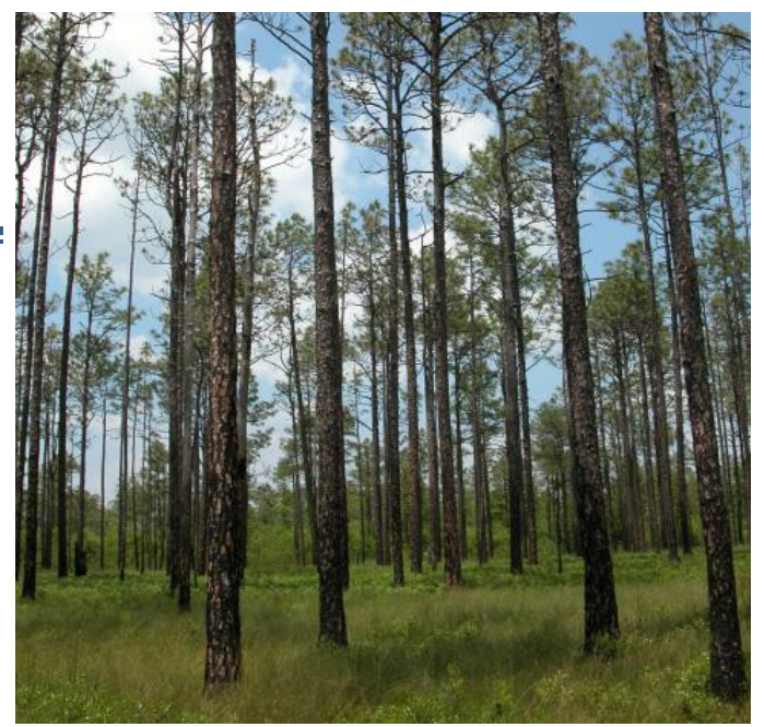
Green Swamp.

A 2002 study by the Trust for Public Land and the American Water Works Association found that for every 10% increase in forest cover in the source watershed, treatment and chemical costs decreased by about 20%: http://forestsforwatersheds.org/forests-and-drinking-water. Similarly, a study of the High Rock Lake watershed in North Carolina showed that water treatment costs trended lower in watersheds that are at least 70% covered in forest: www.ncforestatlas.com/wq/hrlw.