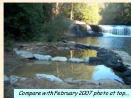
Compare with February 2007 photo at top...