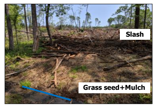
Abundant BMPs at a stream crossing.