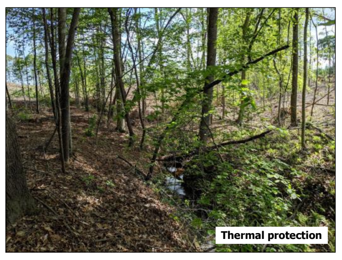
FPGs are outlined in Forestry Leaflet #WQ-1, and SMZs are discussed in Forestry Leaflet #WQ-4.