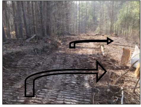
Runoff diversions along a forest road.