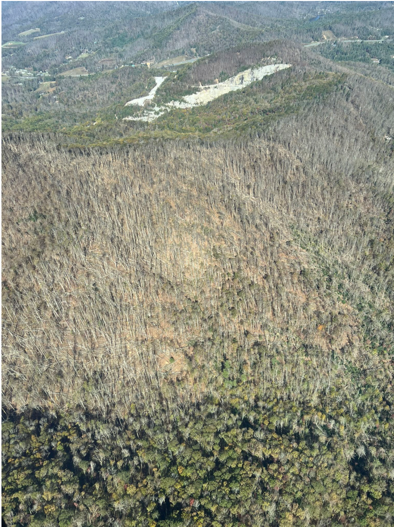
Figure 2: Typical damage on a windward (southerly) slope in the Helene damage area.

While we have seen some other damaging wind events affecting our timber resource in recent decades, this may be the most damaging wind event we have seen in North Carolina since Hurricane Fran in 1996 (Eastern North Carolina) and Hurricane Hugo in 1989 (Western North Carolina). Ground observations by personnel within the damaged areas and pictures coming out of these areas reinforce the observations made.